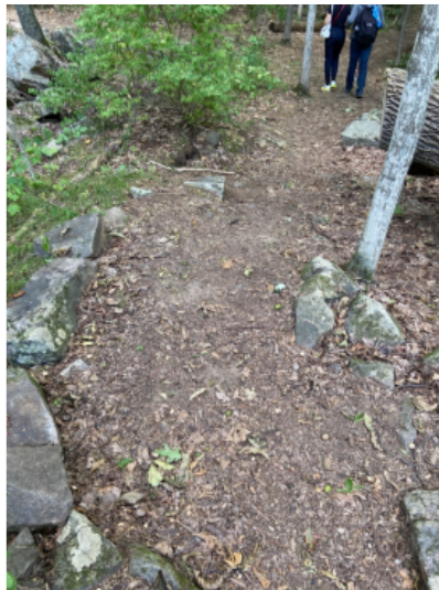
Figure 18: Narrow rocky pathway