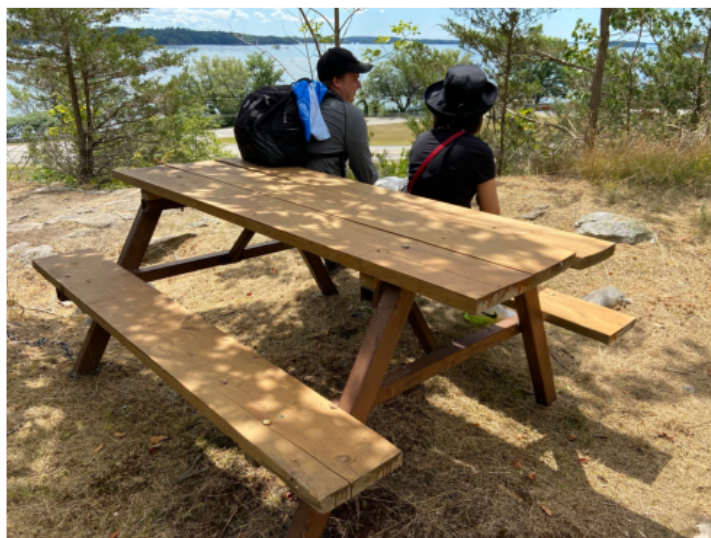
Figure 11: Picnic table is not accessible, terrain rough and rocky with sharp turns