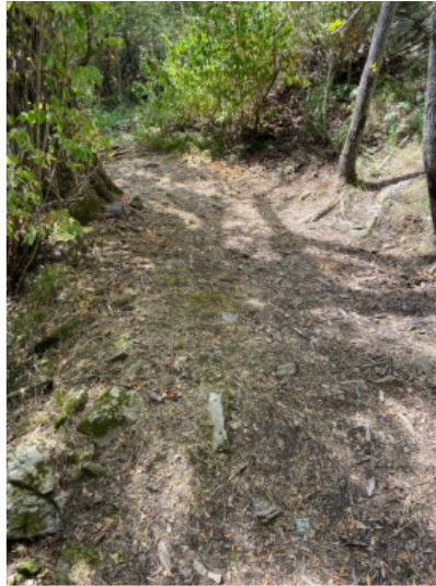
Figure 9: Rocky terrain, trail is becoming more narrow