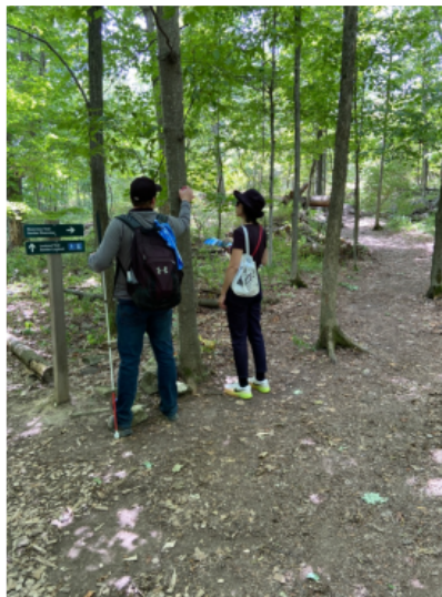
Figure 4: Earth terrain, pretty moderate, slightly steep