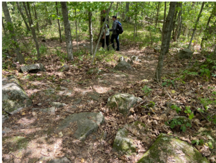
Figure 16: Steep terrain, with lots of rocks sticking out of trail