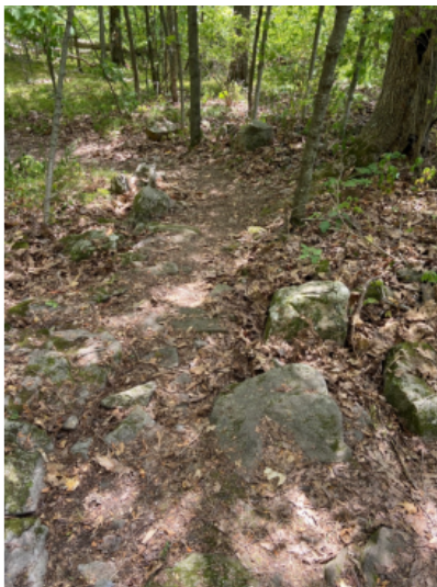
Figure 14: Steep terrain, with lots of rocks sticking out of trail