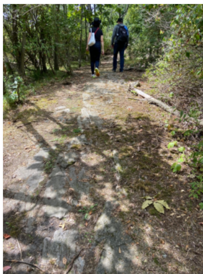
Figure 7: Trail getting more steep, rock surfaces