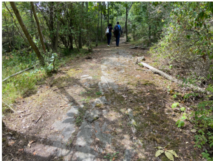
Figure 6: Trail getting more steep, rock surfaces