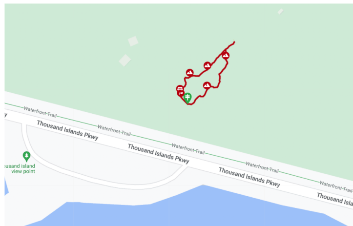
Figure 2: Reviews Locations