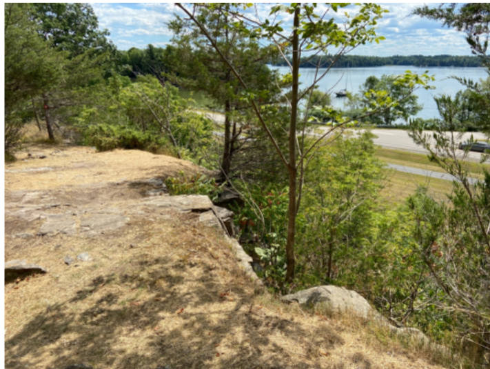
Figure 12: Not accessible, rocky terrain