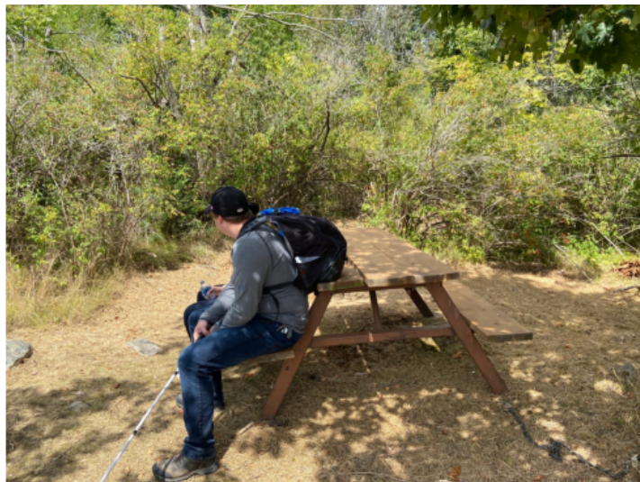
Figure 10: Picnic table is not accessible, terrain rough and rocky with sharp turns