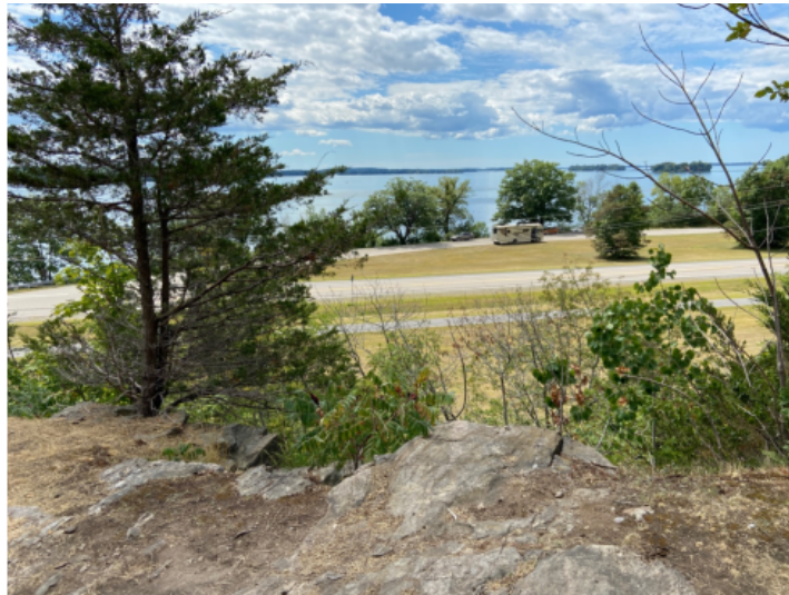
Figure 13: Not accessible, rocky terrain