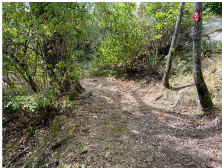
Figure 8: Rocky terrain, trail is becoming more narrow