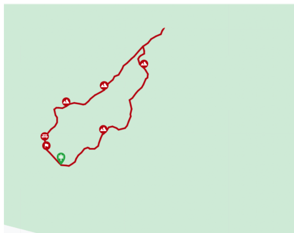
Figure 1: Riverview Trail Thousand Island National Park