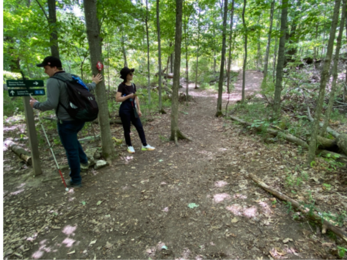
Figure 5: Earth terrain, pretty moderate, slightly steep