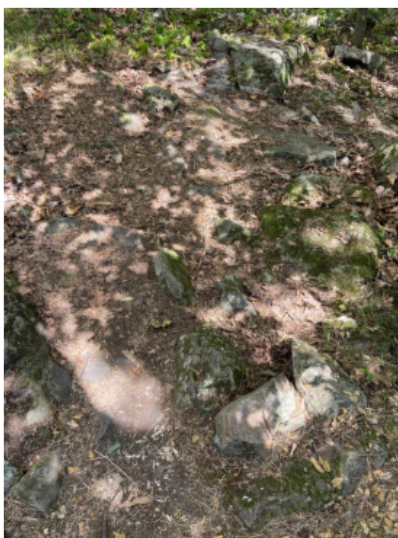
Figure 15: Steep terrain, with lots of rocks sticking out of trail