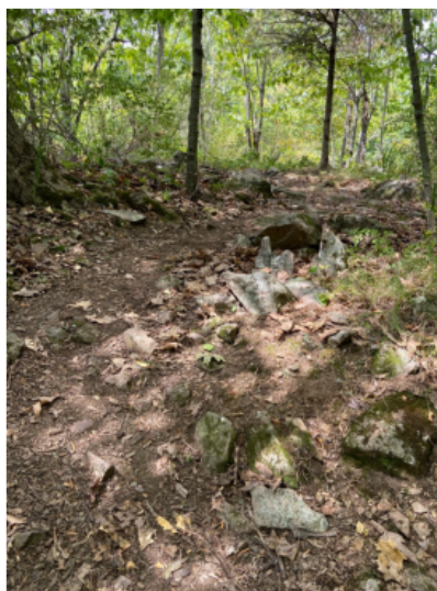
Figure 17: Steep terrain, with lots of rocks sticking out of trail